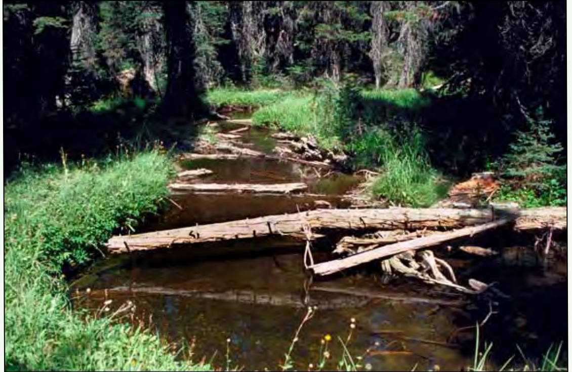
Woody vegetation in Riparian Forest Buffers provides food and cover for wildlife, helps lower water temperatures and slows out-of-bank flood flows.

R iparian Forest Buffers are natural or re-established woodlands next to streams, lakes and wetlands.