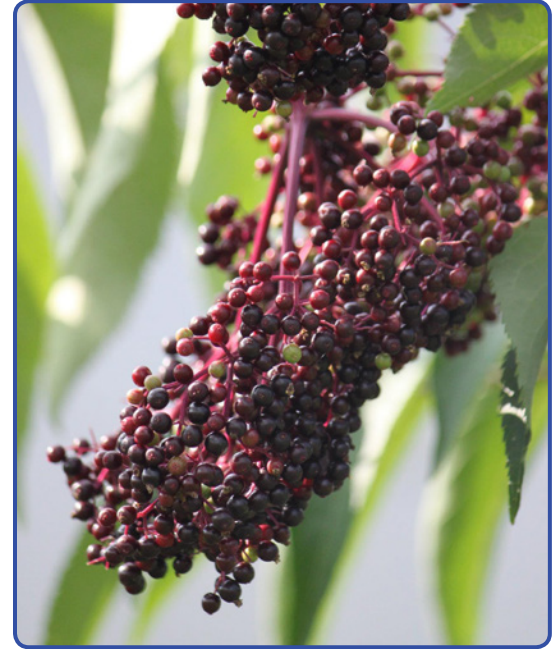
▲ Elderberries can be a component of multifunctional riparian forest buffers.

Riparian buffers planted with a rich diversity of native fruits, nuts, and florals offer the grower a special connection with local tradition, culture, and folklore. Pawpaws, for example, are rarely found on supermarket shelves, but have long been a delicacy. Older fans of pawpaws may buy them at farmers markets to savor a taste from their youth, while those new to pawpaws might further their appreciation of the land where they grow wild. American persimmon, when tasted at peak ripeness in the late fall or early winter, has an unparalleled flavor and is a traditional